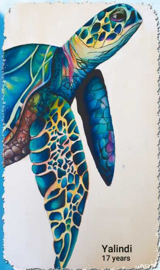
Yalindi 17 years

Creativity challenge for KUAA Children during Melbourne's Covid Lockdown - Parallel to the quiz for adults, KUAA children participated in a creativity challenge and won gift cards. Children's submissions included beautiful artwork, videos of playing musical instruments and origami. We have included some artwork shared by KUAA Children below