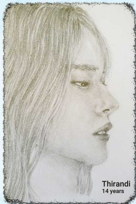
Thirandi 14 years