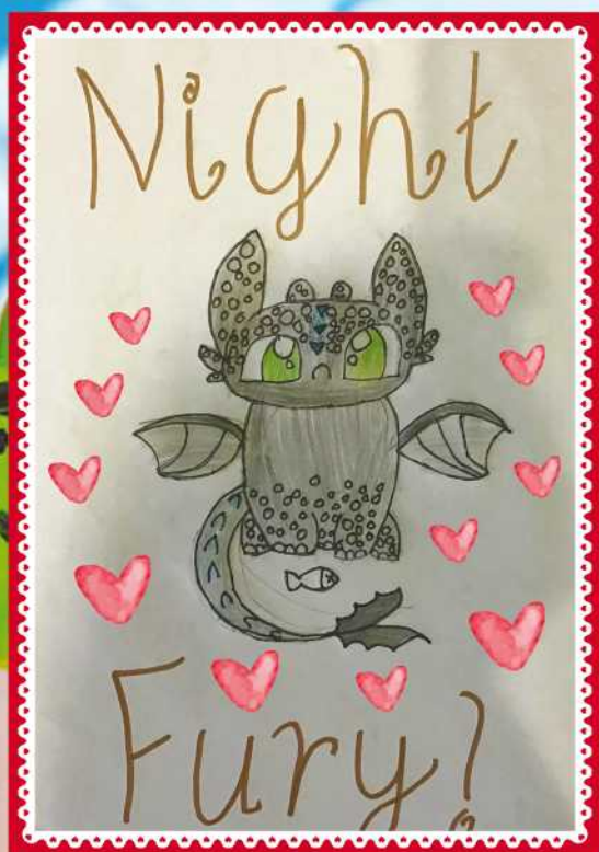
Nevindu 8 years